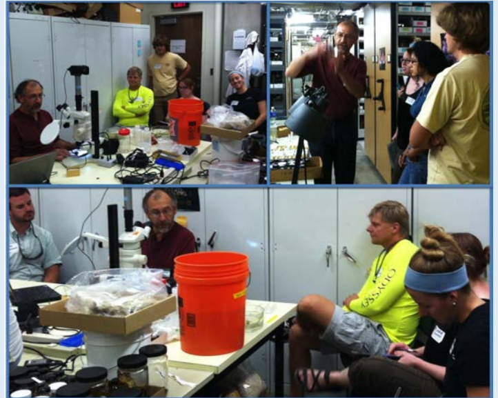
Dr. Gustav Paulay and SURF members at a workshop on the proper collection, preservation, and documentation of museum specimens.

SURF also offers members opportunities to participate in unique workshops. The first was led by Dr. Gustav Paulay and focused on proper collection, preservation, and documentation of museum specimens. Many SURF members attended and plan to contribute specimens that will be sequenced and catalogued, eventually building the DNA library necessary for cutting edge DNA bar-coding techniques. In this way, SURF members can add to their legacy by contributing to the permanent collections of the Florida Museum of Natural History (FLMNH).