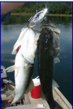
Fish caught using a Rattletrap bait.

Recaptured fish data also supported evidence for bass learning. The lipless crankbait had the lowest incidence of recaptures, with only two bass caught twice with this lure. The soft stickbait had 25 recaptures with the majority of those (n=20) being caught twice. These significant differences in recaptures suggest that Florida Bass were much less likely to be caught again on a lipless crankbait than the soft stickbait, suggesting that after capture Florida Bass were able to learn avoidance for the lipless crankbait to a larger degree than with the soft stickbait.