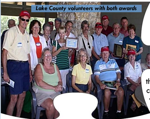
Lake County volunteers with both awards

Since the program's inception, thousands of LAKEWATCH volunteers have collected water quality data on more than 1,100 lakes, 175 coastal sites, 120 rivers, and 5 springs in 57 Florida counties.